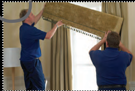
Step 5 Fitting and installation