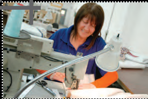
Step 4 Production and make up