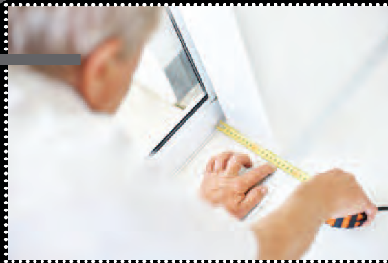
Step 2 Site measuring and estimation