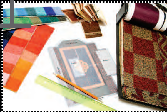
Step 1 Bespoke design